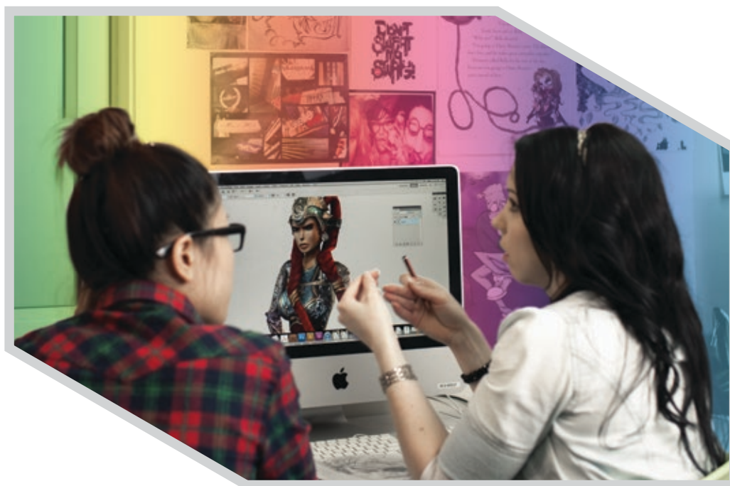
YOOBEE SCHOOL OF DESIGN