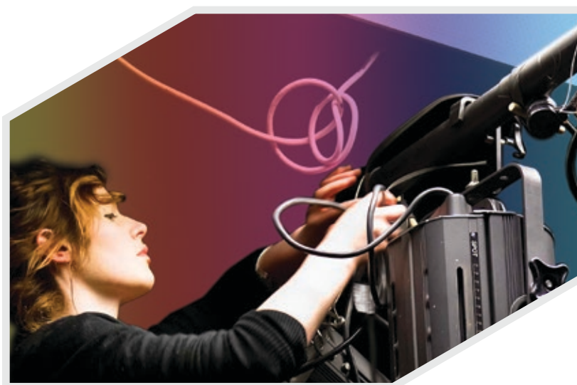
TOI WHAKAARI: NZ DRAMA SCHOOL