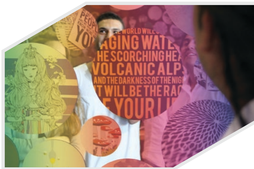
YOOBEE SCHOOL OF DESIGN

Creative jobs like architecture, graphic, interior, landscape, environmental, furniture, industrial and other design jobs are found in the Construction and Infrastructure and Manufacturing and Technology Pathways. Creative communications roles are also in high demand across the Services and Social and Community Services Pathways.