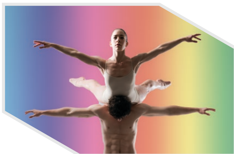
NEW ZEALAND SCHOOL OF DANCE.