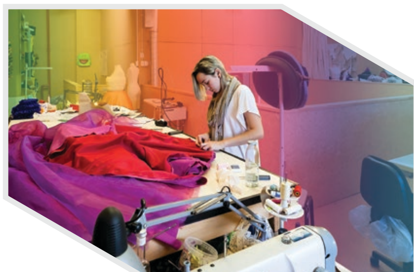
TOI WHAKAARI: NZ DRAMA SCHOOL