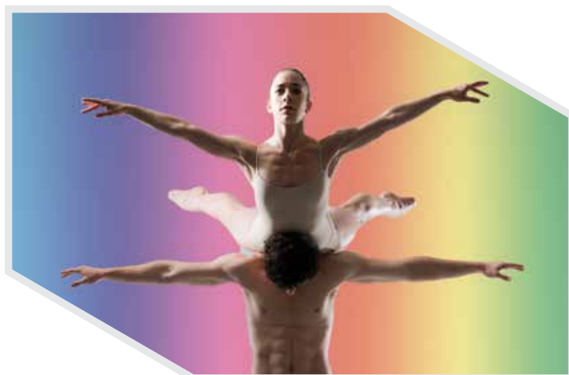
NEW ZEALAND SCHOOL OF DANCE.