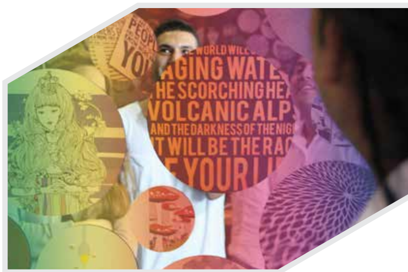
YOOBEE SCHOOL OF DESIGN

Creative jobs like architecture, graphic, interior, landscape, environmental, furniture, industrial and other design jobs are found in the Construction and Infrastructure and Manufacturing and Technology Pathways. Creative communications roles are also in high demand across the Services and Social and Community Services Pathways.