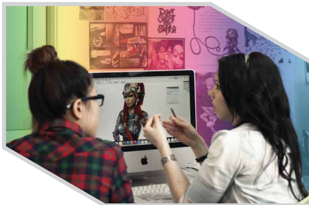
YOOBEE SCHOOL OF DESIGN