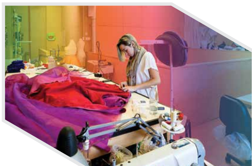
TOI WHAKAARI: NZ DRAMA SCHOOL