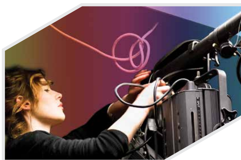
TOI WHAKAARI: NZ DRAMA SCHOOL